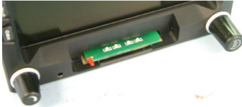
Figure 1 Old style knobs